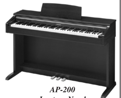
AP-200 In-store Now!